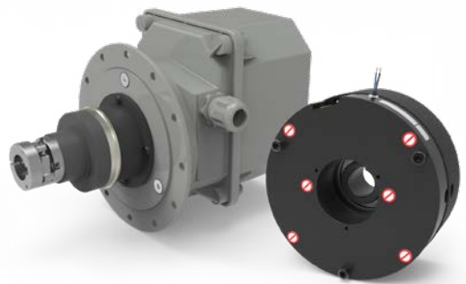
Popular Stromag Series 51 Limit Switch and EZX Tooth Clutch assemblies provide packaged convenience. Extremely quiet Warner Electric FENIX Brakes are ideal for use in theater applications.

Huco Flex Ni nickel bellows couplings were also supplied. Units were mounted to encoders to eliminate misalignment problems experienced by the customer. Flex Ni couplings provide exceptional rotation position integrity. This is achieved through high torsional stiffness while still accommodating large amounts of lateral and angular misalignment due to low spring rates in these directions.