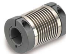
Flex Ni couplings provide rotation position integrity. This is achieved through high torsional stiffness while still accommodating large amounts of lateral and angular misalignment due to low spring rates in these directions.